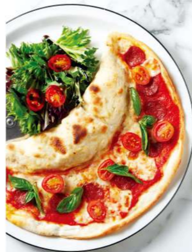
Rock 'n Roll 薄餅兄弟