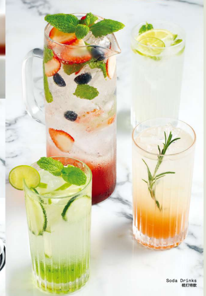
Soda Drinks 梳打特飲