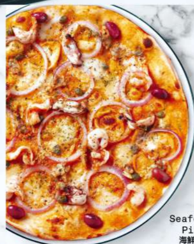
Seafood Pizza 海鮮薄餅