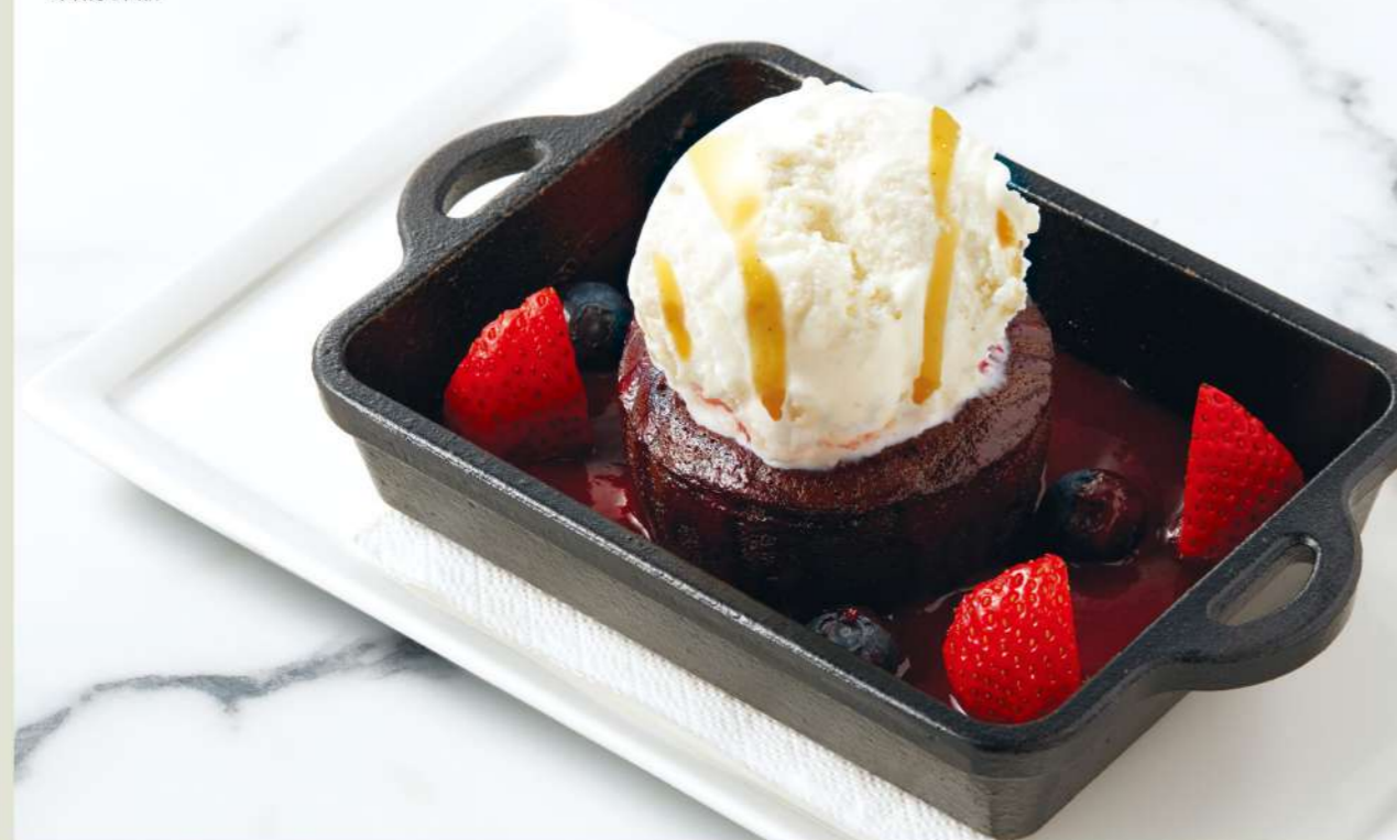
Chocolate Lava Cake 朱古力心太軟

Sweetness can stimulate the production of endorphins that are secreted in the brain to create the feeling of pleasure. Pick one of our fantastic desserts and treat yourself to a happiness hit.