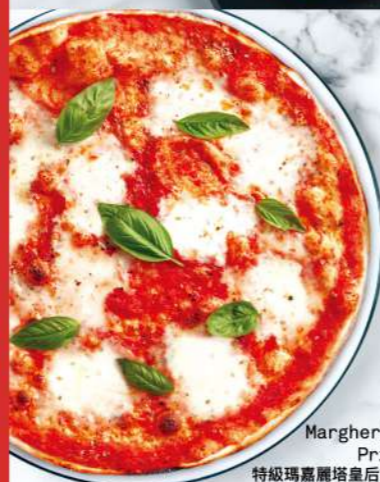
Margherita Prima 特級瑪嘉麗塔皇后薄餅