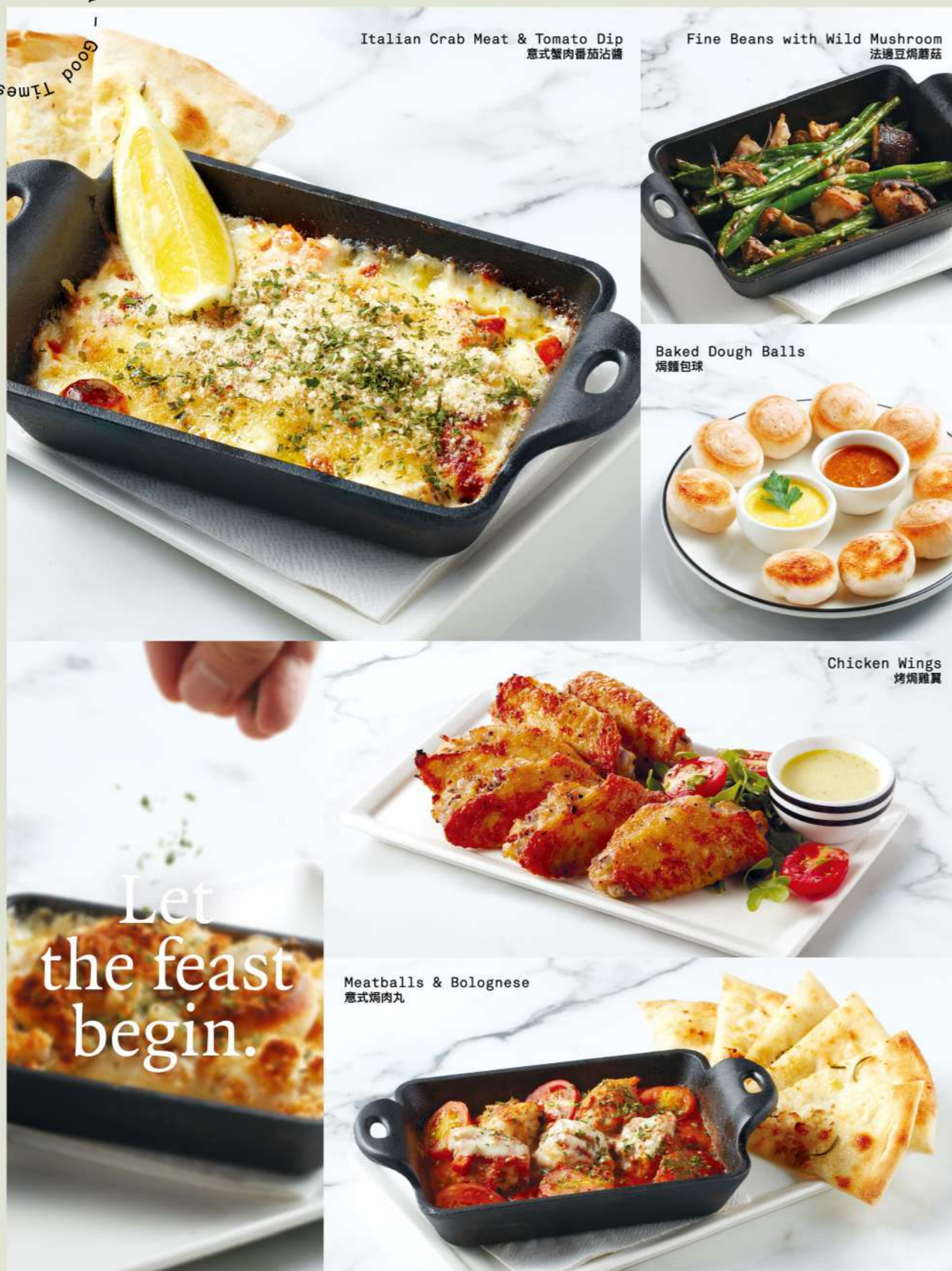
Italian Crab Meat & Tomato Dip 意式蟹肉番茄沾醬