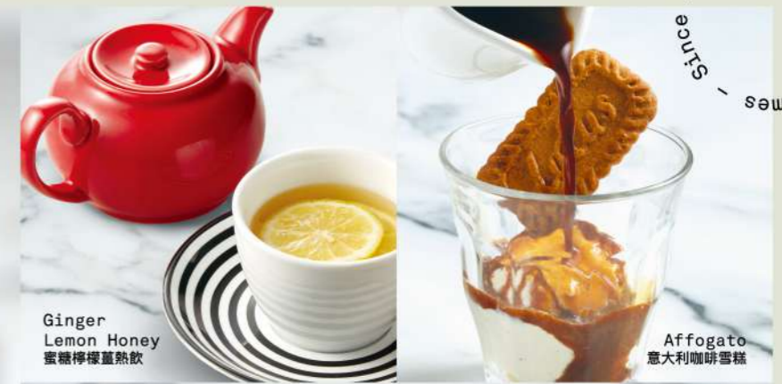
Ginger Lemon Honey 蜜糖檸檬薑熱飲