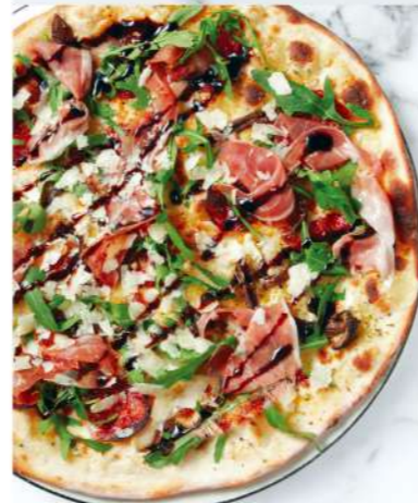
Porcini Chorizo Pizza 牛肝菌西班牙腸薄餅