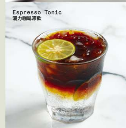
Espresso Tonic 湯力咖啡凍飲

Drink enough fluid to boost your energy and power your wellness to keep you feeling positive & motivated.