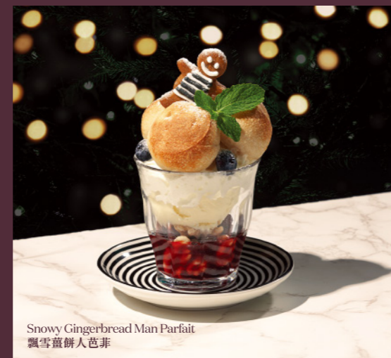
Snowy Gingerbread Man Parfait 飄雪薑餅人芭菲

Gingerbread man, vanilla ice cream, dough balls, walnut, dried cranberry, strawberry sauce, blueberry, whipping cream & Lotus Biscoff biscuit 薑餅人、呔呢啤雪糕、焗麵包球、合桃、紅莓乾、士多啤梨果醬、藍莓、忌廉及焦糖餅乾