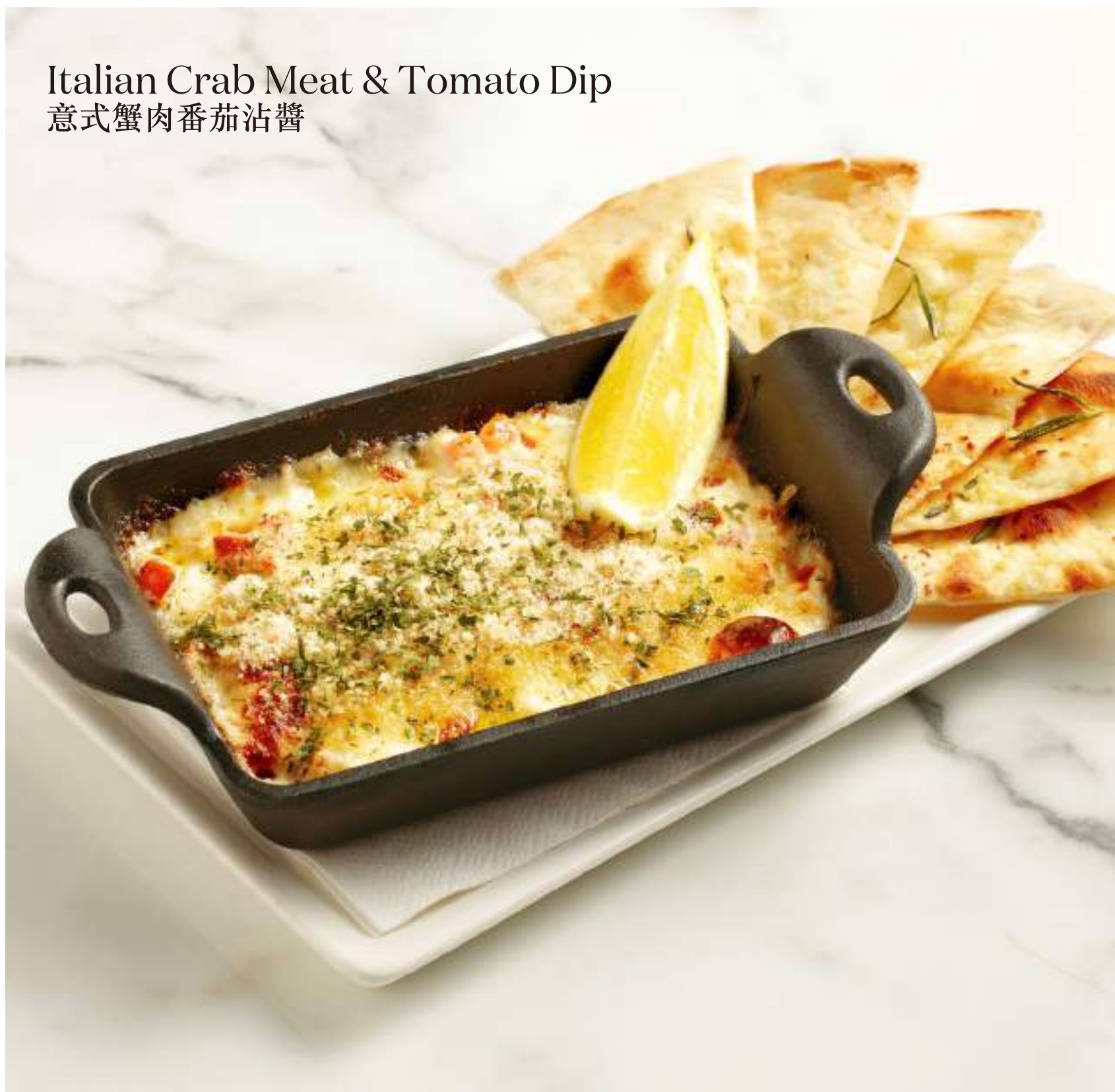
Italian Crab Meat & Tomato Dip 意式蟹肉番茄沾醬