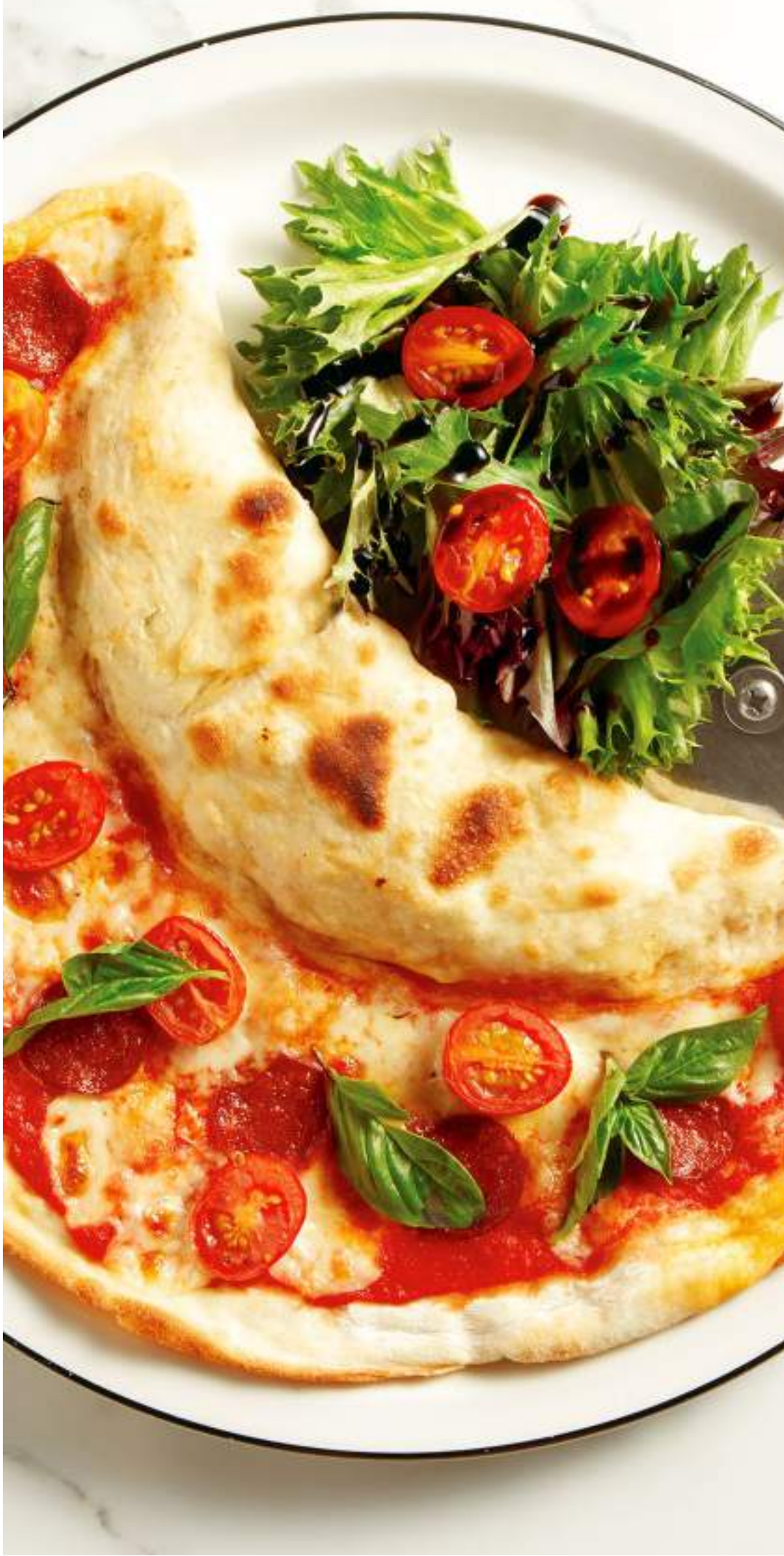
Rock 'n Roll 薄餅兄弟