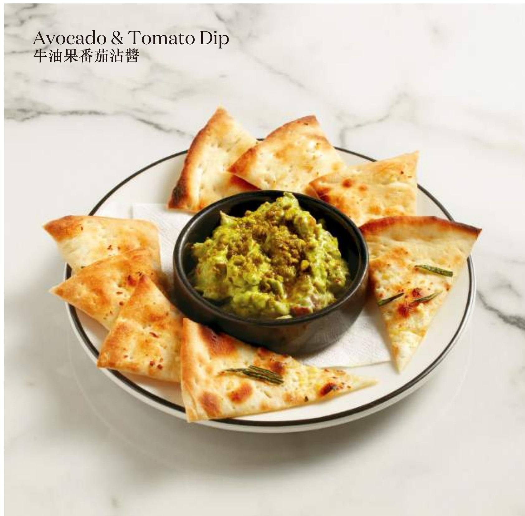
Avocado & Tomato Dip 牛油果番茄沾醬