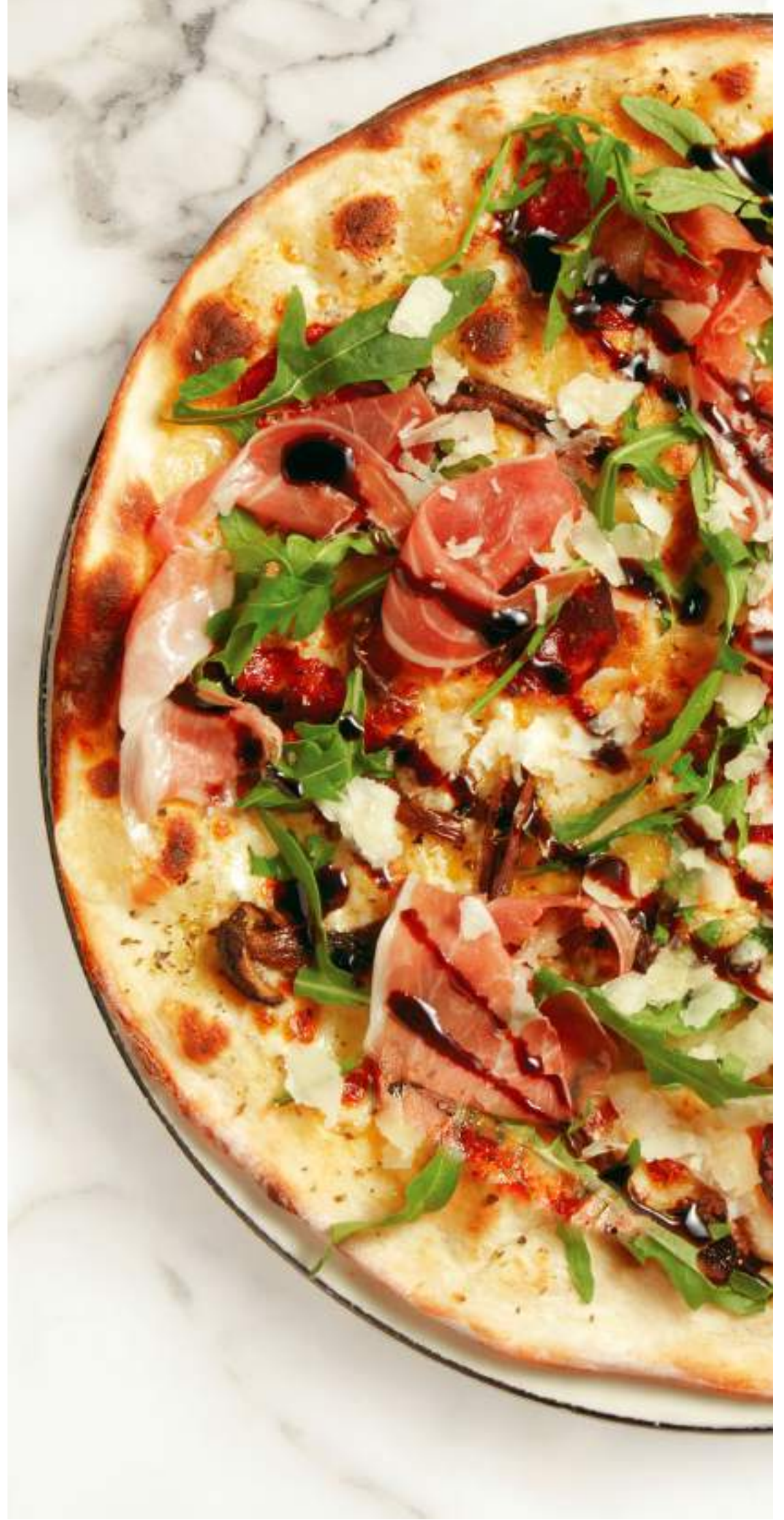
Porcini Chorizo Pizza 牛肝菌西班牙腸薄餅