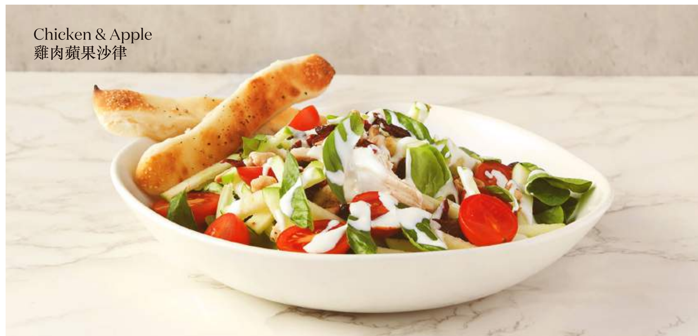
Chicken & Apple 雞肉蘋果沙律