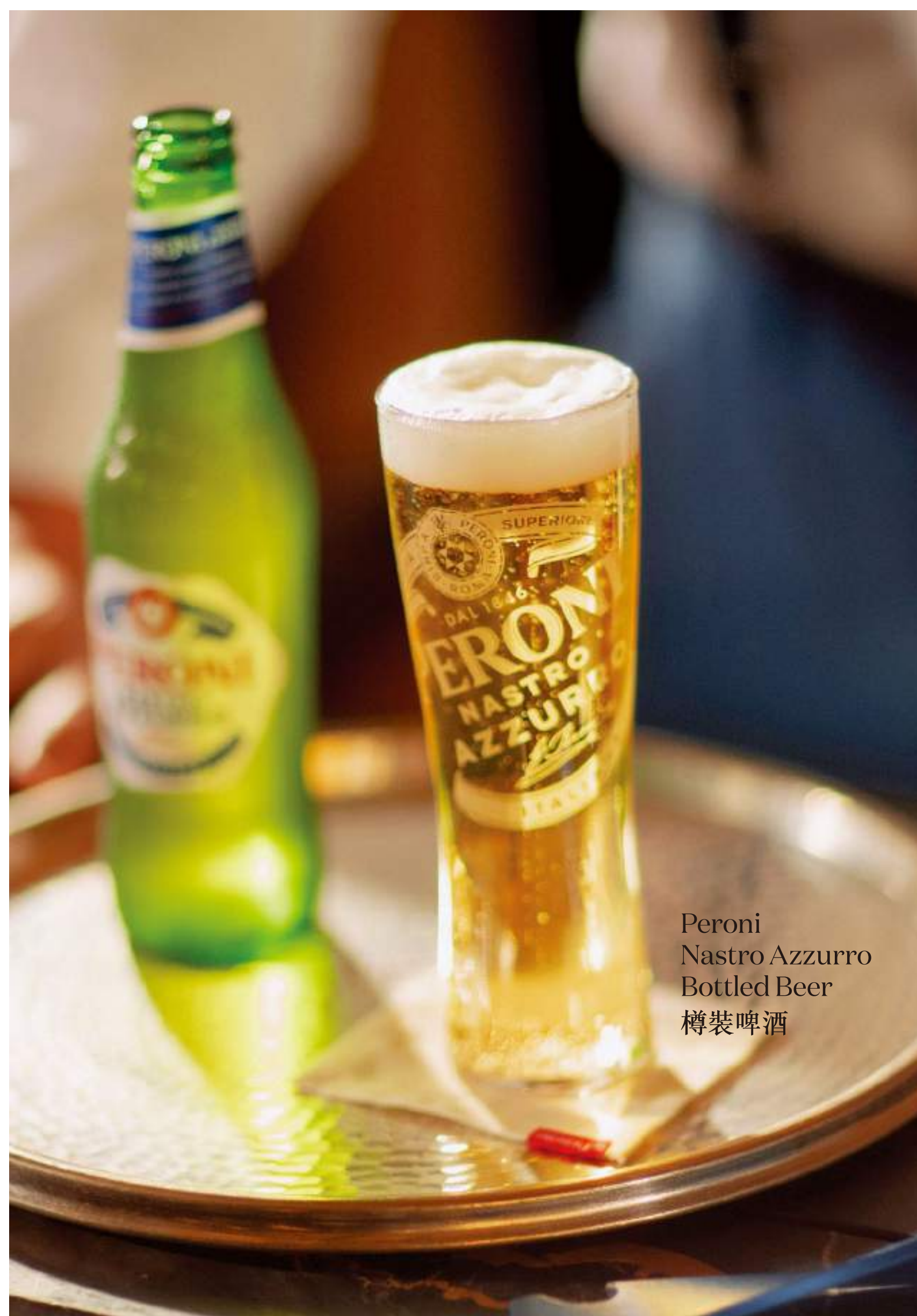
Peroni Nastro Azzurro Bottled Beer 樽裝啤酒

Alcohol content higher than 1.2% 酒精濃度在1.2%以上