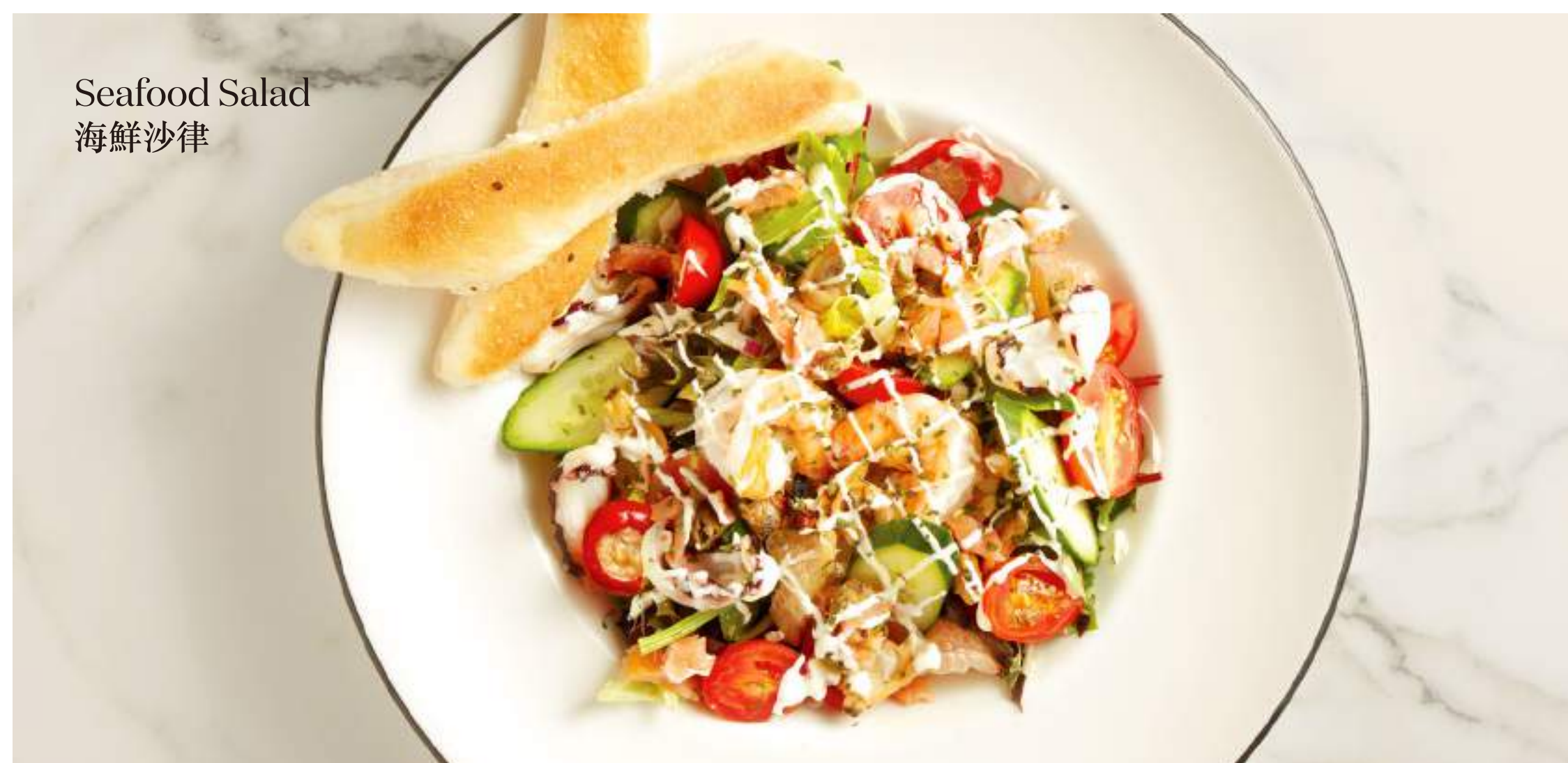
Seafood Salad 海鮮沙律