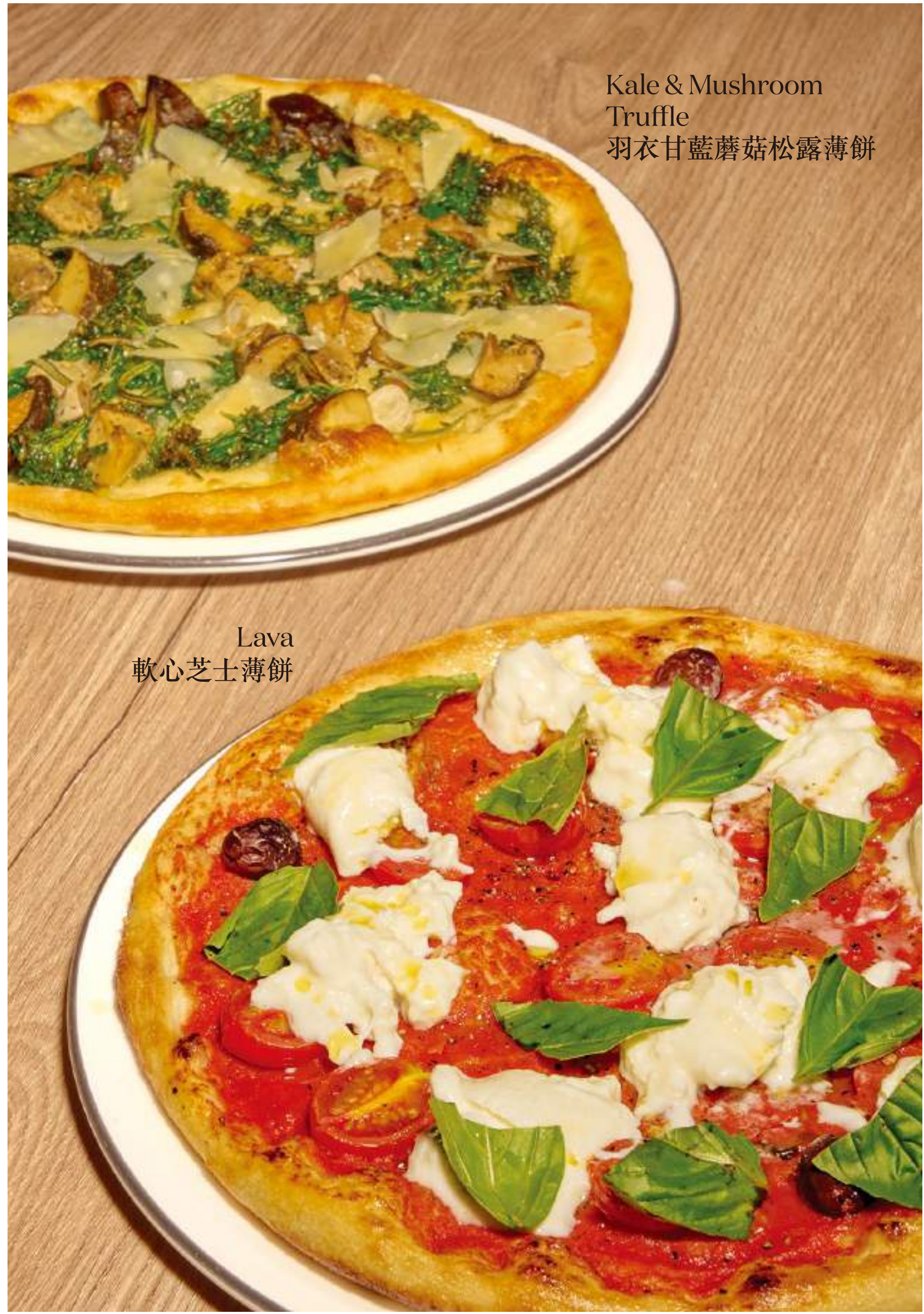
Kale & Mushroom Truffle 羽衣甘藍蘑菇松露薄餅