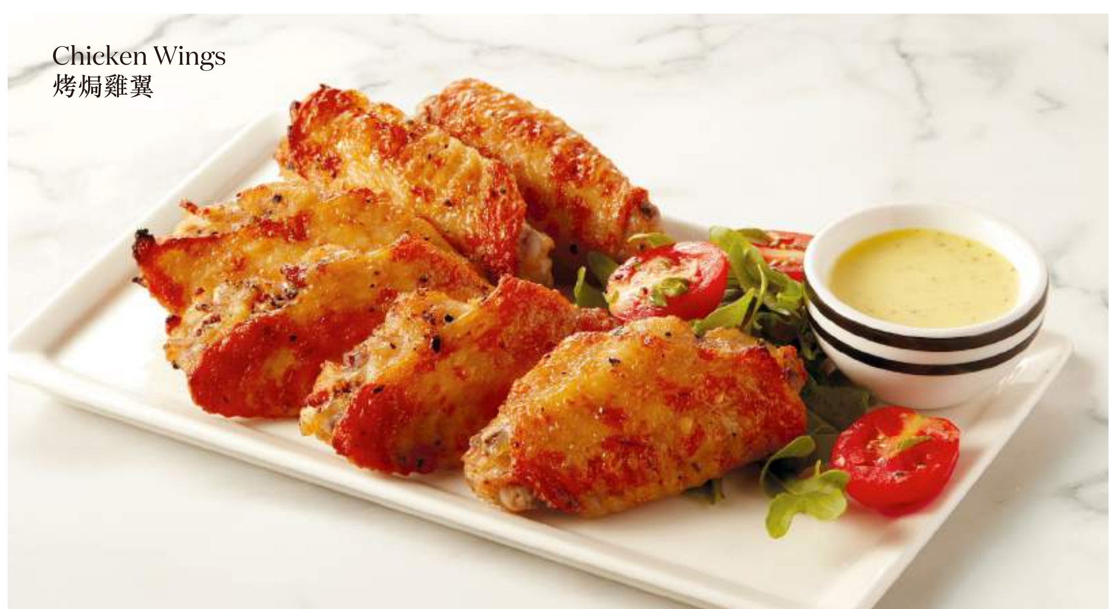
Chicken Wings 烤焗雞翼