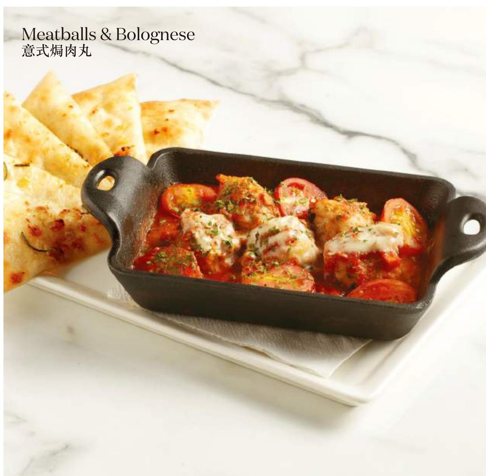
Meatballs & Bolognese 意式焗肉丸