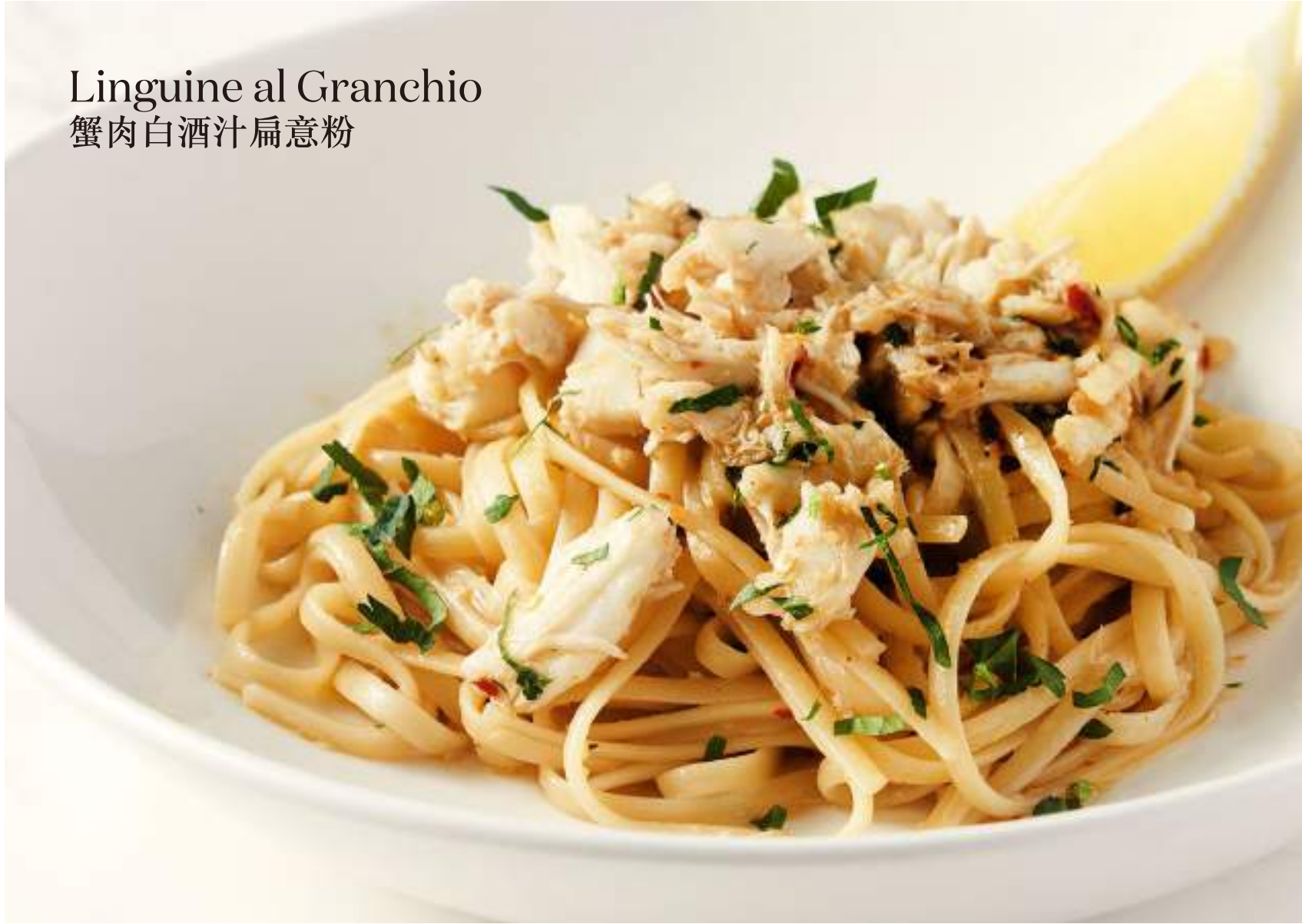
Linguine al Granchio 蟹肉白酒汁扁意粉