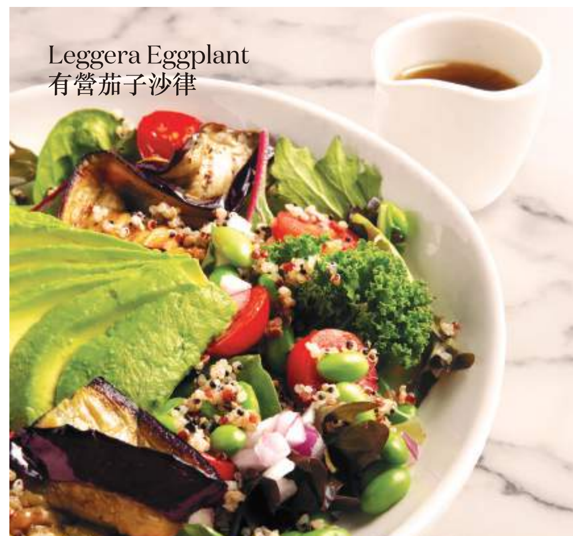
Leggera Eggplant 有營茄子沙律