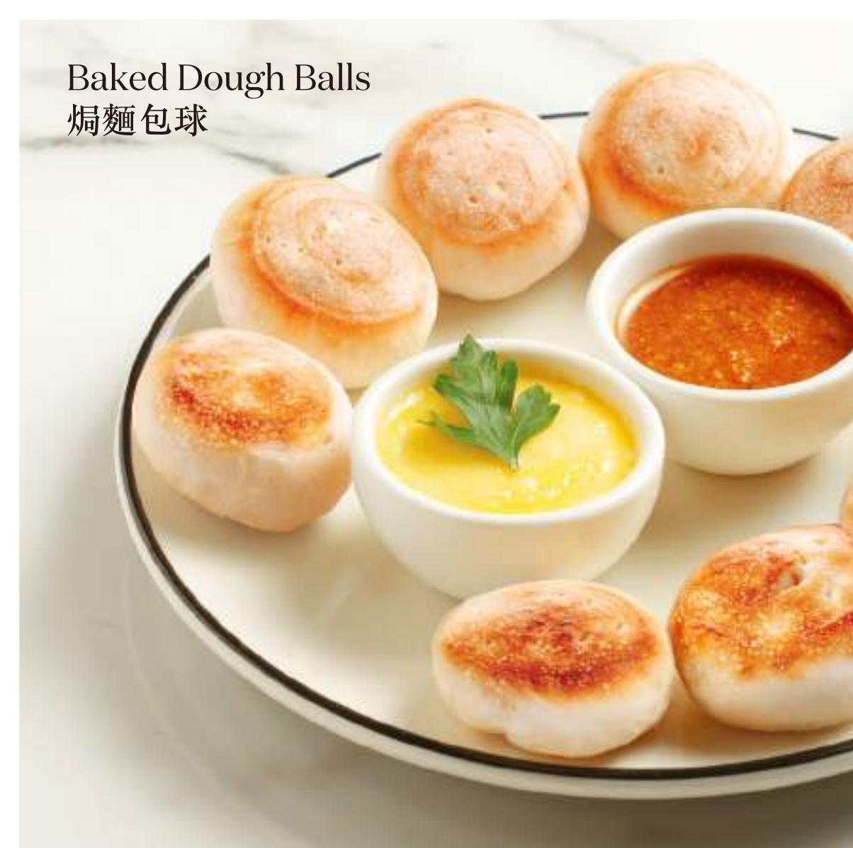
Baked Dough Balls 焗麵包球

帕爾馬火腿、摩特黛拉火腿、煙三文魚、新鮮馬蘇里拉芝士、橄欖、釀小紅椒，灑上黑醋醬及配以香草包