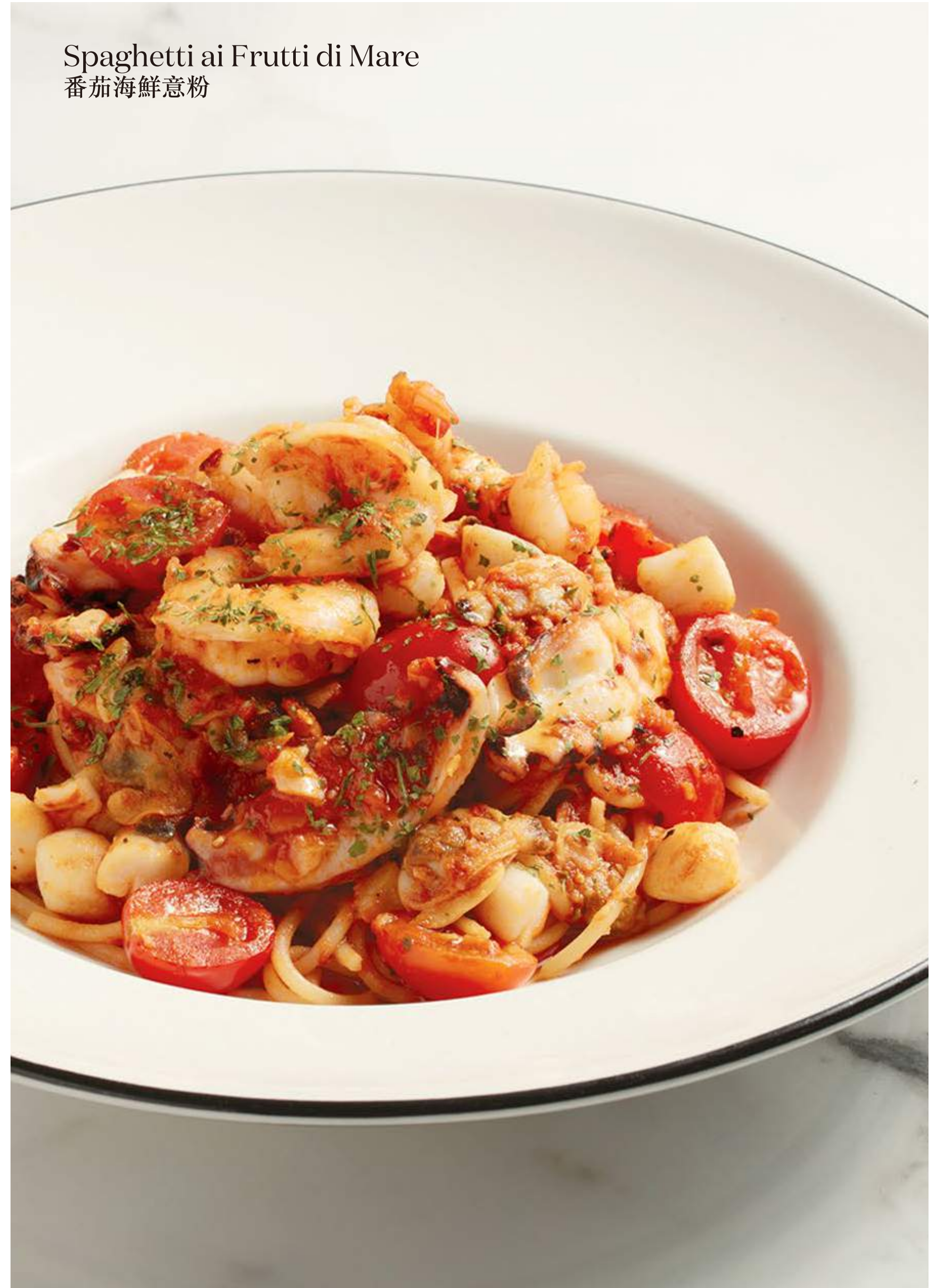
Spaghetti ai Frutti di Mare 番茄海鮮意粉