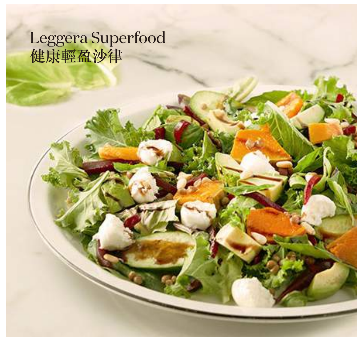
Leggera Superfood 健康輕盈沙律