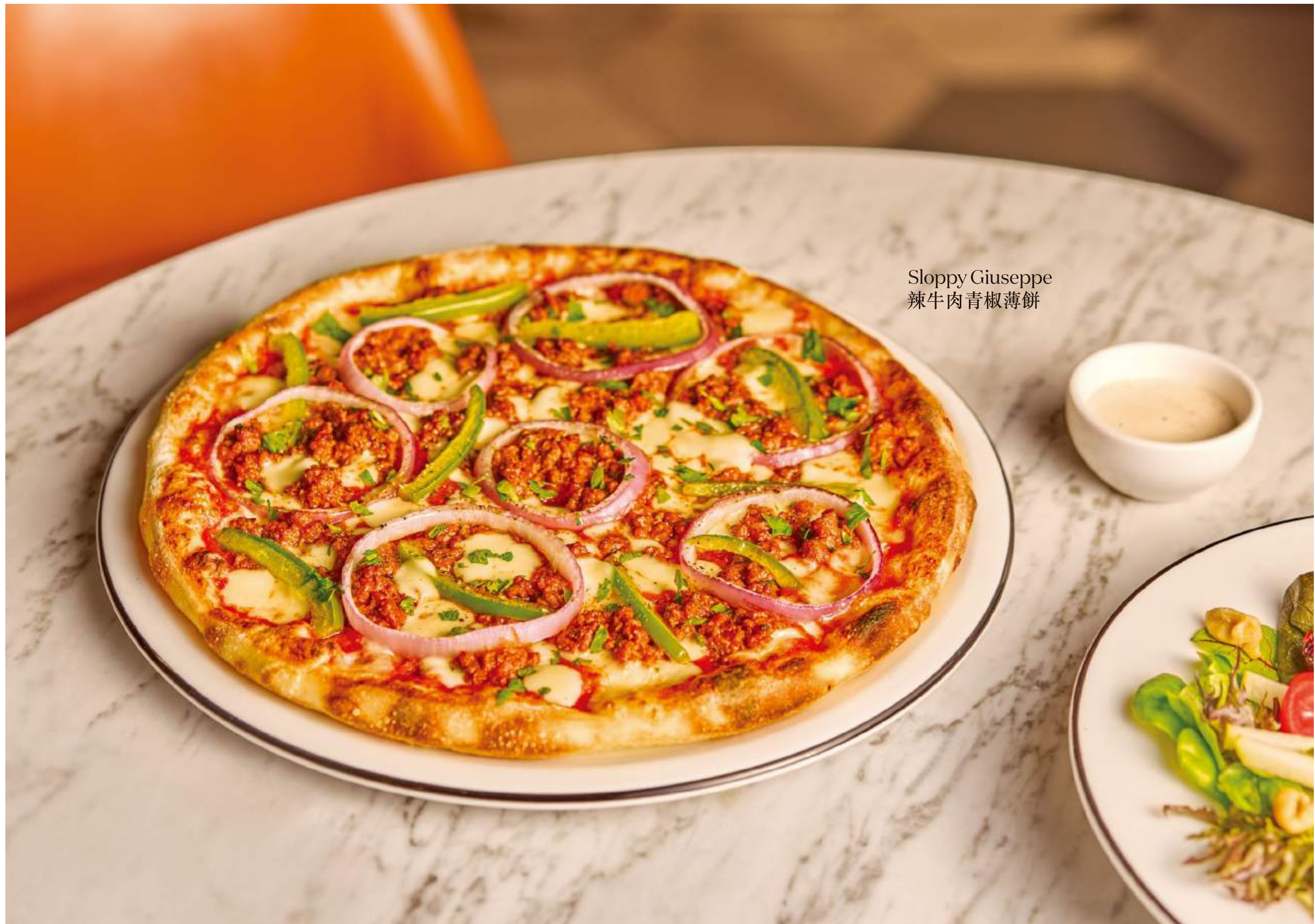
Sloppy Giuseppe 辣牛肉青椒薄餅