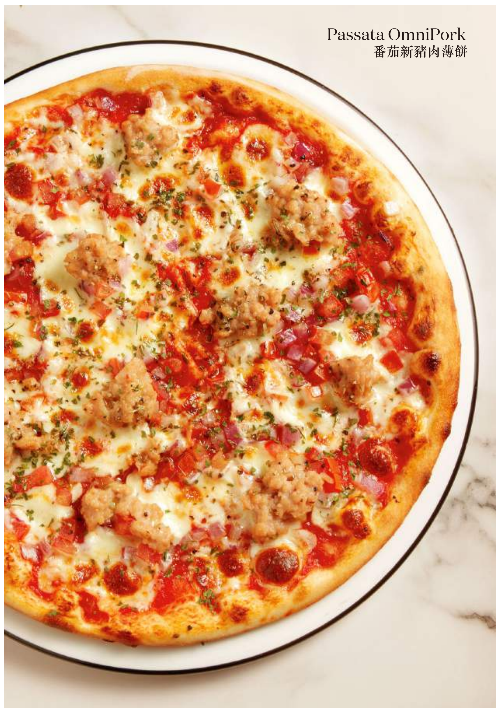
Passata OmniPork 番茄新豬肉薄餅