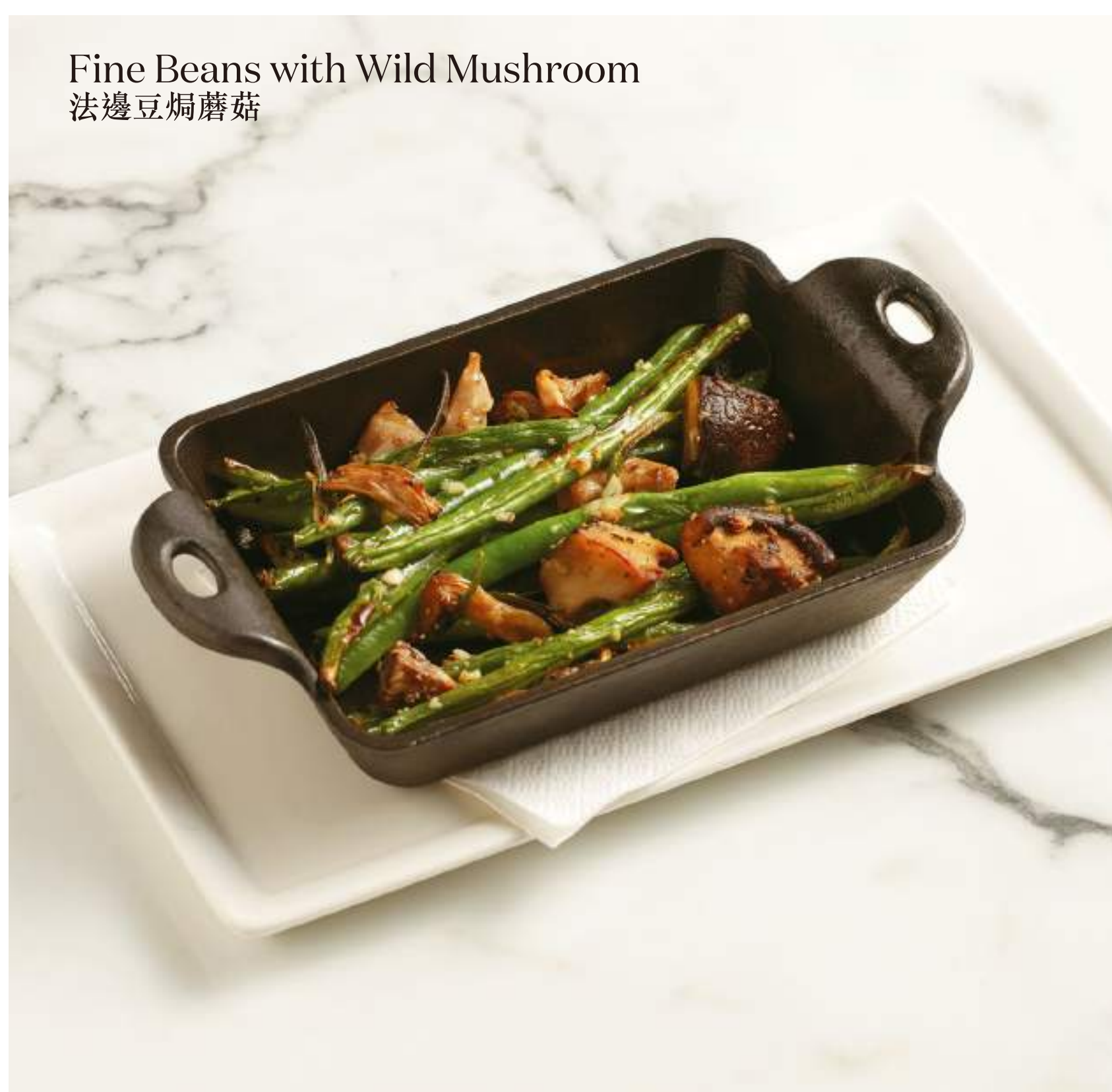
Fine Beans with Wild Mushroom 法邊豆焗蘑菇